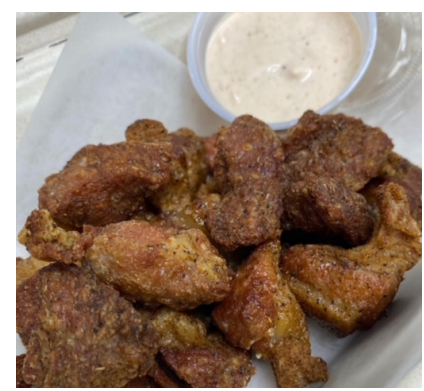
***Spice Level is 5/10 Medium or ask for SPICIER***

80z. cubed boneless Pork-Butt Roast seasoned and deep fried served with Dis & Dat Dip