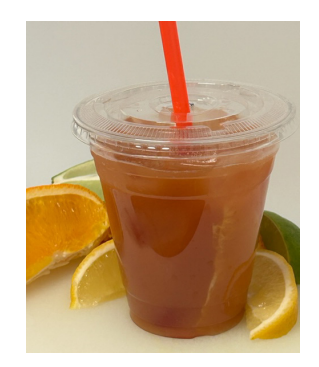
***Alcohol Free Drink***

120z. Crazy concoction of fruit juices with a splash of Guava Juice, complemented with a slice of Orange and a Maraschino Cherry