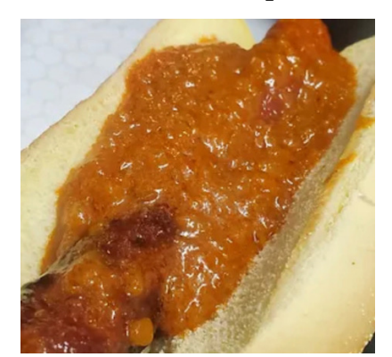
***Spice Level is 8/10 Spicy***

SPICY Pork Sausage on a 6" bun with Jack Miller's Cajun BBQ Sauce served with 10z. Bag of Alaska Chips