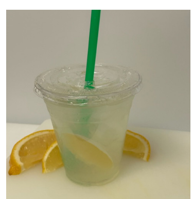
***Alcohol Free Drink***