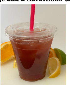
***Alcohol Free Drink***

120z. Crazy concoction of fruit juices with a splash of Pomegranate Juice, complemented with a slice of Orange and a Maraschino Cherry