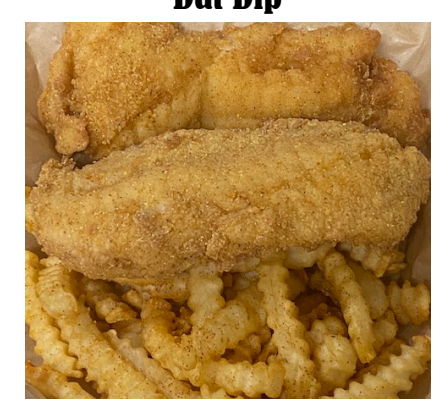
***Spice Level is 4/10 Light Medium***

(2) 7-80z. Alaskan Rockfish Fillets & 1 lb. Cajun Crinkles, scratch made tartar sauce and Dis & Dat Dip