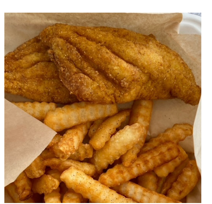
***Spice Level is 4/10 Light Medium***

5-70z. Louisiana Catfish Fillet & ½ lb. Cajun Crinkles served with scratch made tartar sauce