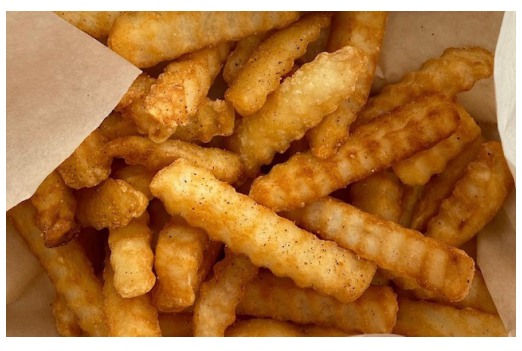
***Spice Level is 7/10 Spicy***

Substitute your 1 oz. bag of Alaska Chips for ½ lb. order of Cajun Crinkles