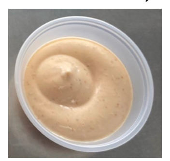
***Spice Level is 6/10 Medium*** $1 to add to any Po'Boy in place of Tartar Sauce

20z. cup of Spicy, Zesty, Zingy Mayo based dip with Cajun Spices (Our version of Remoulade Sauce)