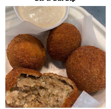
***Spice Level is 5/10 Medium***

DELICIOUS mixture of Pork, Chicken, Seasonings and White Rice rolled in Bread Crumbs fried and served with Dis & Dat Dip