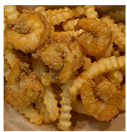
***Spice Level is 2/10 Mild***

5 Jumbo Shrimp & ½ lb. Cajun Crinkles served with scratch made tartar sauce