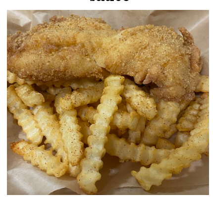
***Spice Level is 4/10 Light Medium***

7-80z. Alaskan Rockfish Fillet & ½ lb. Cajun Crinkles served with scratch made tartar sauce