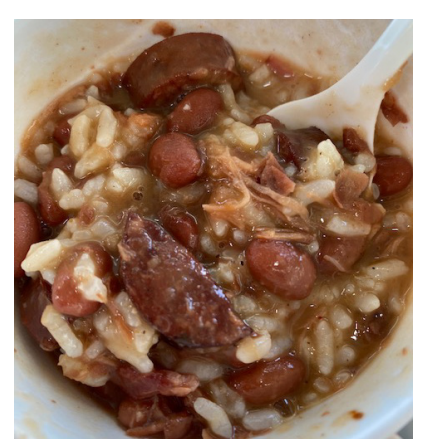
***Spice Level is 5/10 Medium***

160z. Red Beans, Andouille Sausage and Cajun Spices over White Rice