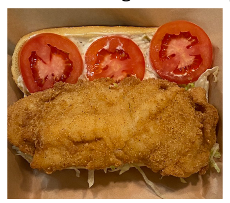
***Spice Level is 4/10 Light Medium***

7-80z. Alaskan Rockfish Fillet on 6" bun with lettuce, tomato and scratch made tartar sauce served with 10z. Bag of Alaska Chips