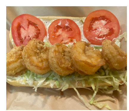
***Spice Level is 2/10 Mild***

Jumbo Shrimp on 6" bun with lettuce, tomato and scratch made tartar sauce served with 10z. Bag of Alaska Chips