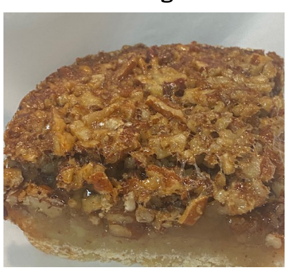
***YUMMINESS Level is 10/10***

Scratch made dessert with a Pecan Sandie Cookie Crust topped with a delicious Pecan Pie Filling