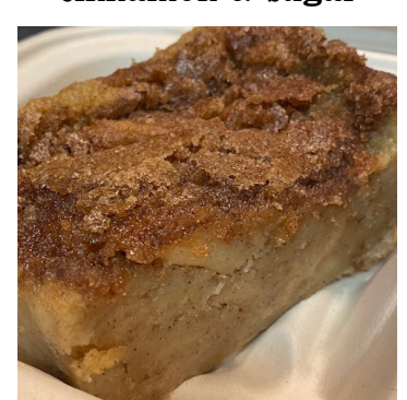
***YUMMINESS Level is 10/10***

Baked scratch made custard with French Bread, Cinnamon & Sugar