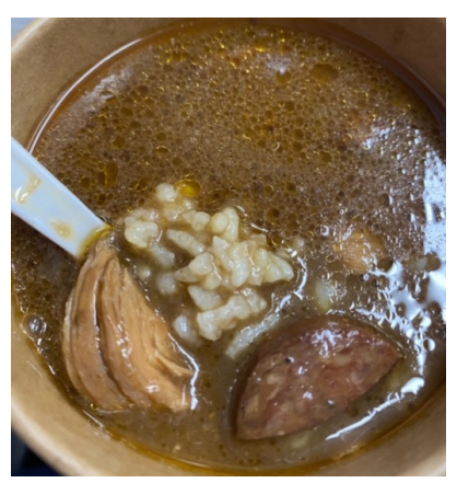
***Spice Level is 5/10 Medium***

160z. Chicken & Andouille Sausage in a Cajun Brown Roux over White Rice