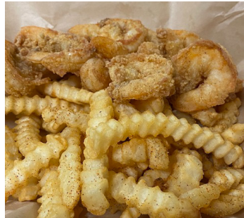
***Spice Level is 4/10 Light Medium***