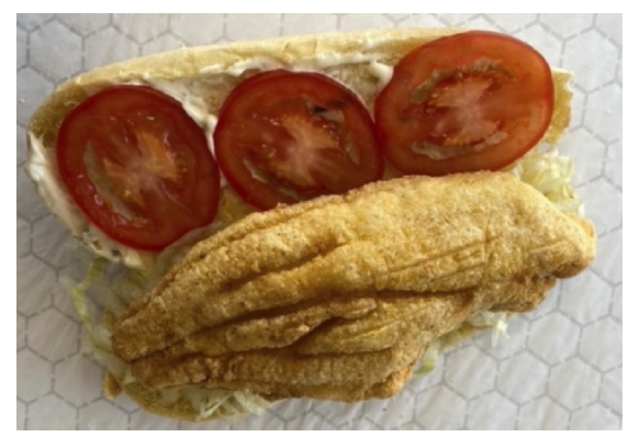
***Spice Level is 4/10 Light Medium***

5-70z. Louisiana Catfish Fillet on 6" bun with lettuce, tomato and scratch made tartar sauce served with 10z. Bag of Alaska Chips